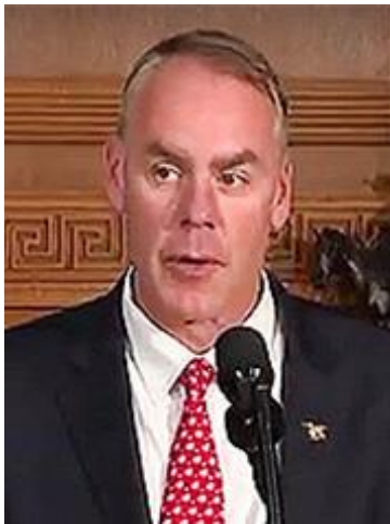
Interior Secretary Ryan Zinke.

The leaked memorandum shows Zinke urged Trump to reduce the acreage of four national monuments, including both Grand Staircase Escalante and Bears Ears, as well as Cascade-Siskiyou National Monument in Oregon and California and Gold Butte National Monument in Nevada.